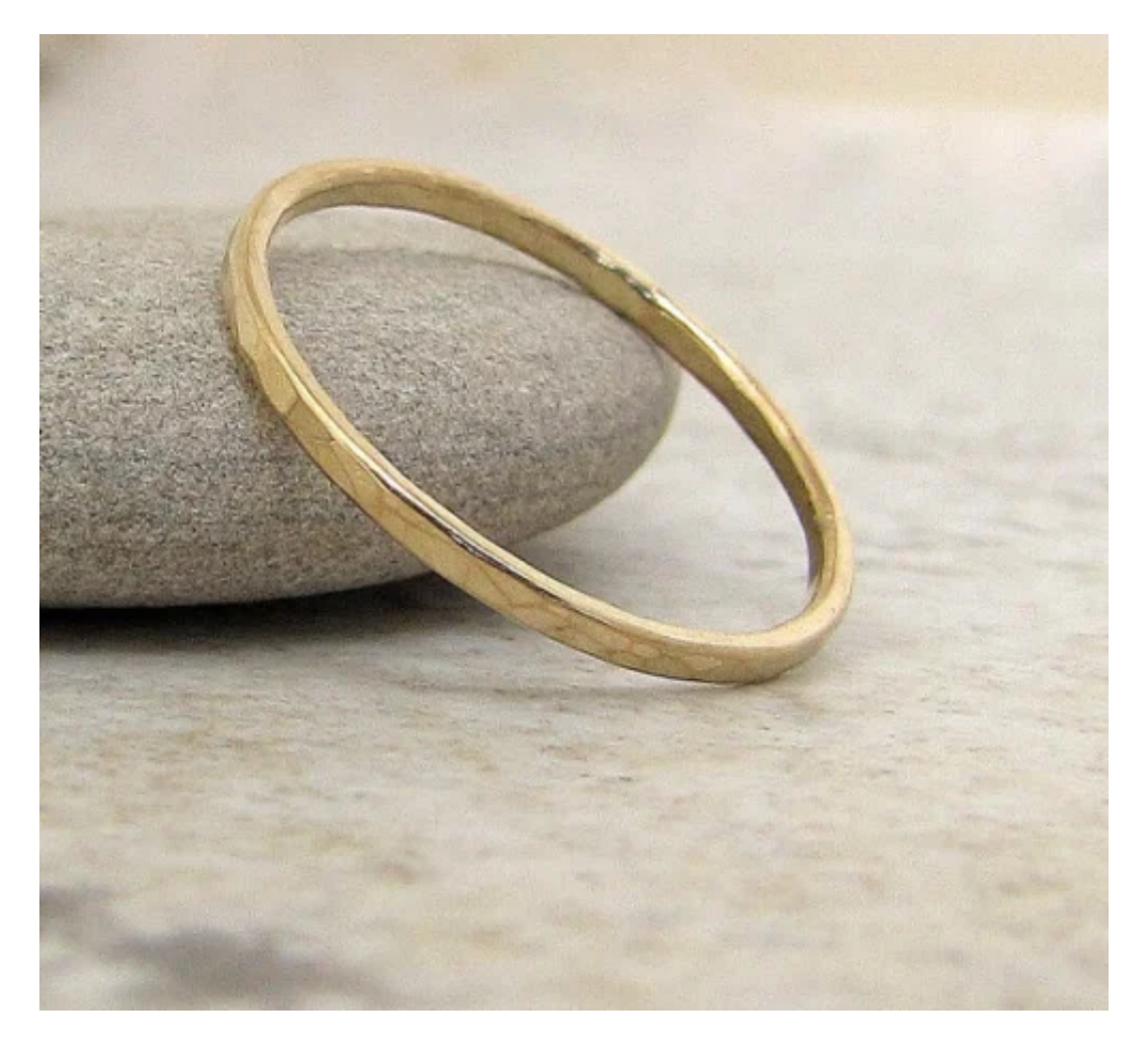
14 carat hammered gold wedding ring by GoldSmack