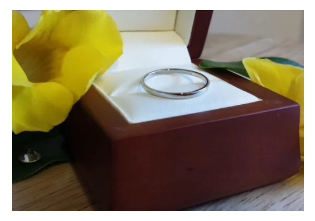
Super thin platinum wedding band by Aiyla Maison