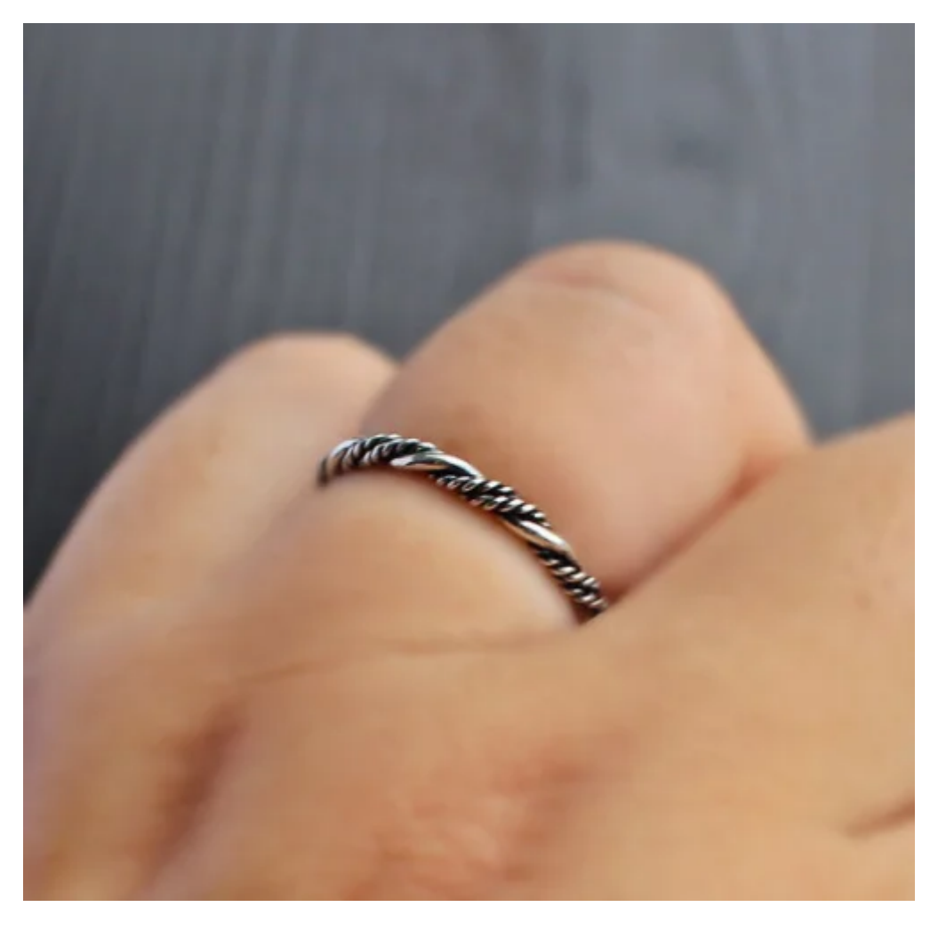
Double twisted silver wire band by Saruchi R Jewellery

If you'd like to make your own ultra \underline{\text{thin stacker rings}} why not join us for our very popular evening taster class? Suitable for beginners.