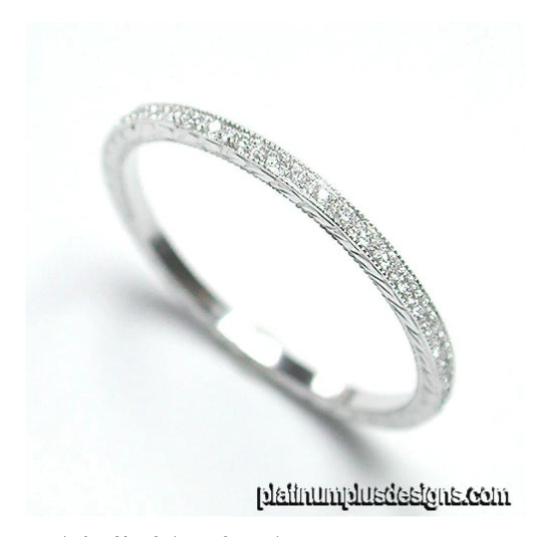
<u>Platinum eternity band by Platinum Plus Designs</u>