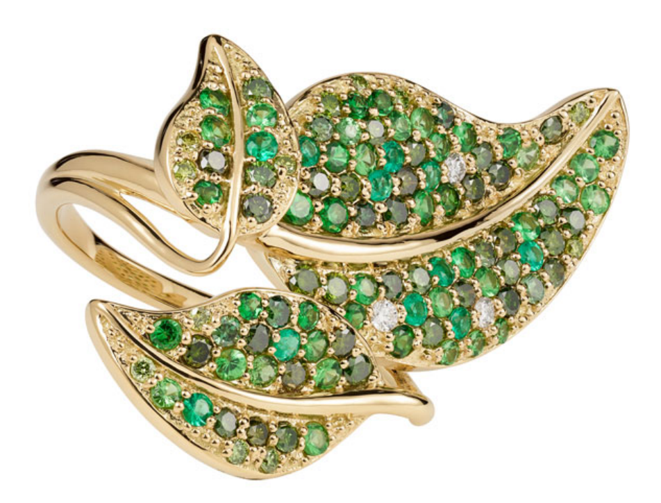
Fennelle ring in 18k yellow gold with 5.8 cts. t.w. tsavorite, green diamonds, and white diamonds, $8,800; <u>Misahara (https://misahara.com/)</u>