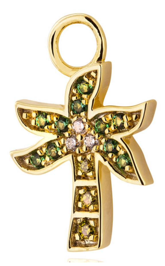
Palm Tree charm in 14k yellow gold with lab-grown emeralds and diamonds, £250 ($347); Lark & Berry (https://larkandberry.com/)

Monstera leaf earrings in brass, $65; <u>Rhubarb Handcrafted Jewelry</u> (<u>https://www.instagram.com/rhubarbjewelry/</u>)