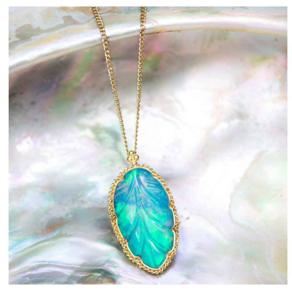
Carved leaf pendant in 18k yellow gold with 4.47 ct. Ethiopian opal, $2,420; <u>Amáli Jewelry (https://amalijewelry.com/)</u>

But this isn't a lesson in plants, though it may read as such. It stands to serve as the reasoning for which I believe such a leaf is the ideal candidate for an icon in jewelry, particularly given our affinity for symbolic and meaningful pieces.