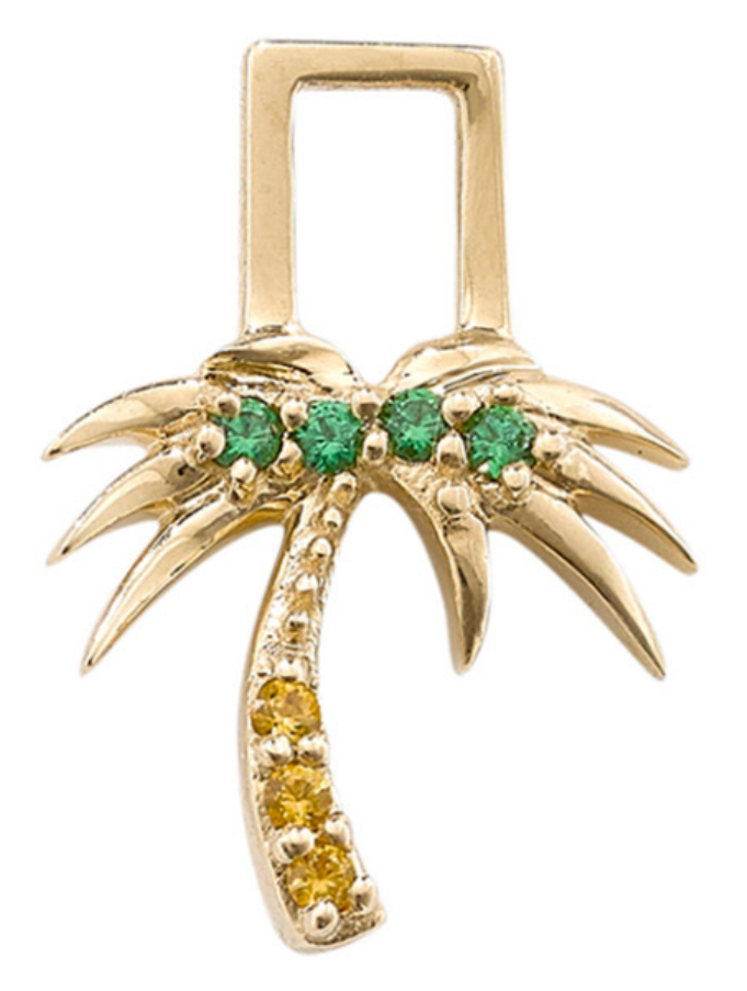
Palm Tree EarWish in 14k yellow gold with yellow sapphire and tsavorite, £315 ($437); <u>Robinson Pelham (https://www.robinsonpelham.com/fine-</u> <u>jewellery/palm-tree-earwish-yellow-sapphire/</u>)</u>

Jardin palm leaf earrings in 18k yellow gold with 1.05 cts. t.w. champagne diamonds, $4,850; <u>Syna Jewels (https://synajewels.com/products/jardin-palm-leaf-diamond-earrings? pos=1& sid=691837110& ss=r)</u>