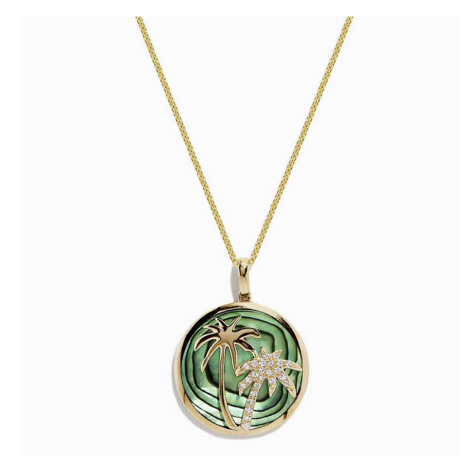
Palm Tree pendant in 14k yellow gold with abalone and diamonds, $695; <u>Effy</u> <u>Jewelry (https://www.effyjewelry.com/)</u>