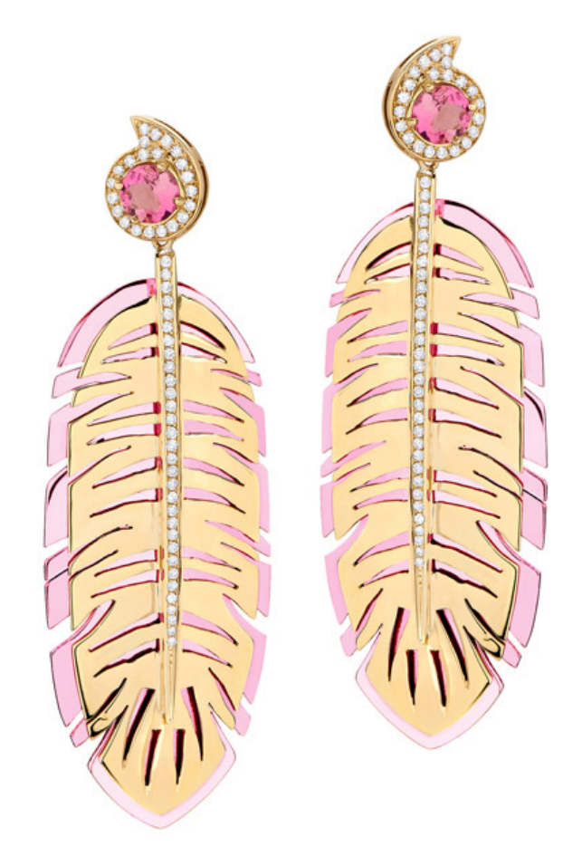
Banana leaf earrings in 18k yellow gold with pink tourmaline and diamonds, price on request; <u>Carol Kauffmann</u> <u>(https://carolkauffmann.com/en/produto/brinco-bananeira-g)</u>

Personally, I dream of adding a shiny gold monstera charm to my collection, if I can find one (Maui Divers has an <u>entire collection dedicated to the plant</u> (<u>https://www.mauidivers.com/collections/monstera-collection</u>), if you're interested). It just feels relevant, a reminder to hang in there, that we're tough and beautiful and strong.