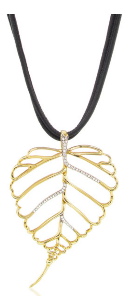
Pendant in 18k yellow gold with diamonds, $6,200; <u>Angela Cummings for Assael</u> (<u>https://assael.com/product-category/collaborations/angela-cummings/</u>)